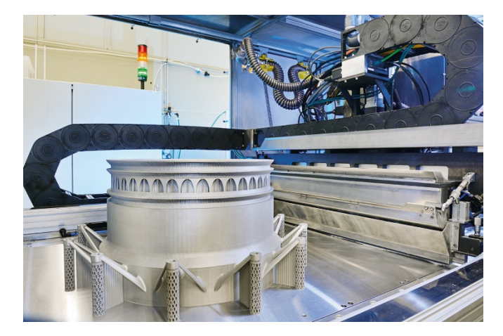
Image 1: Several lasers at Fraunhofer ILT in Aachen use 3D printing to transform metal powder into a demonstrator component for the future generation of Rolls-Royce engines.

Project duration: July 2017 – November 2020 www.futuream.fraunhofer.de/en.html