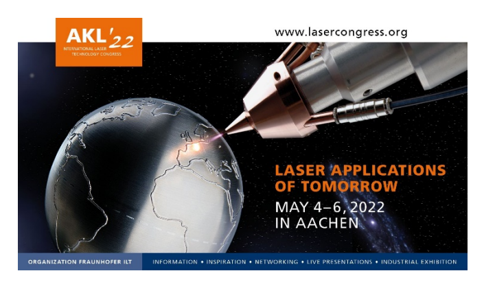
Image 2: AKL'22 – the comprehensive insight into the world of laser technology at the intersection of business and science.