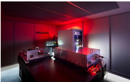
Fig. 1 The quantum frequency converter developed by Fraunhofer ILT allows qubits to be transmitted with low noise and loss between distributed quantum computers via existing telecommunications networks.

Lecture program at the World of Quantum: Application panels: Topic overview (world-of-photonics.com)