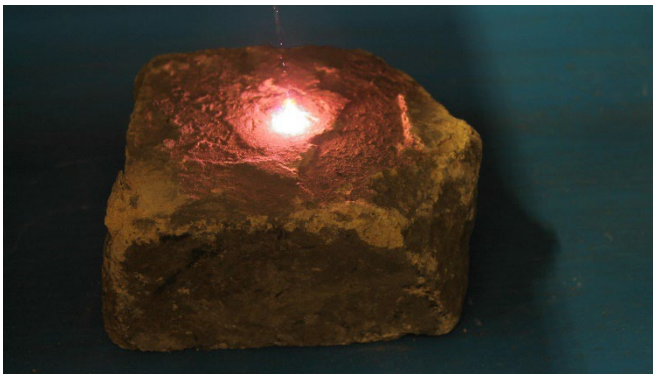
Image 3: Used refractories are detected with laser measurements and reused in a CO 2 -saving way.