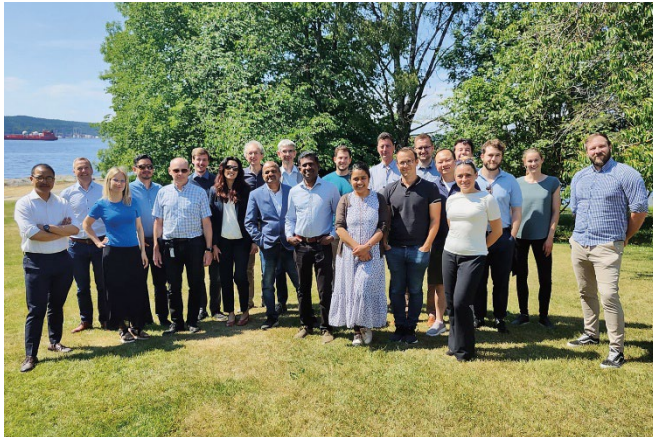
Image 2: Experts from nine European companies and institutes are cooperating in the ReSoURCE project. Together, they are dedicated to the development of sustainable recycling solutions for refractory materials.