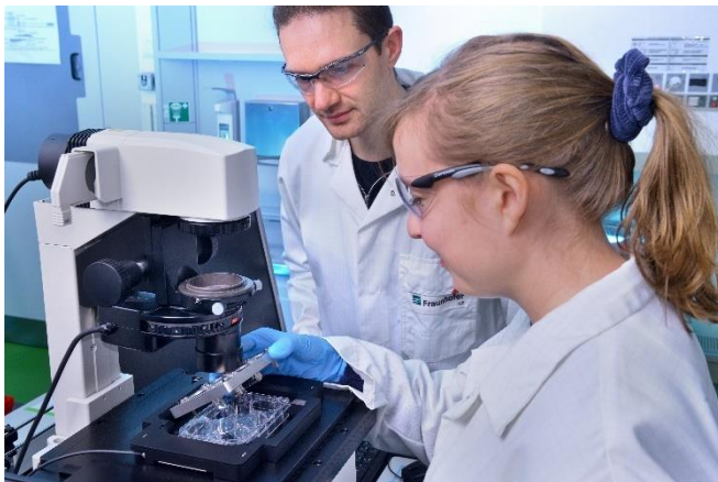
Image 4: Researchers at Fraunhofer ILT are testing the LIFTOSCOPE for AI-assisted, fully automated high-throughput sorting of living cells by pulsed laser radiation.