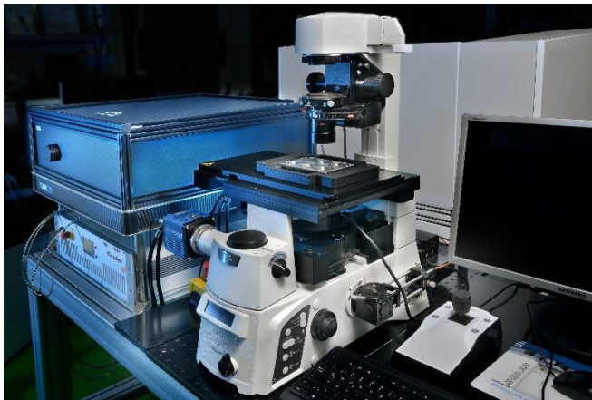
Image 2: The LIFTOSCOPE combines high-speed microscopy, AI-based analysis and localization of living cells and cell clusters with laser-induced forward transfer (LIFT). The laser is coupled directly into the beam path of the microscope via mirrors. Users can switch between camera observation and the LIFT process.