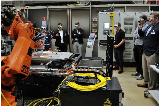
Image 3: The lab tour offers insights into Fraunhofer ILT's HydrogenLab. The laboratory is equipped with state-of-the-art laser technology and enables interdisciplinary collaboration to optimize the series production of fuel cells and hydrogen components.

PRESS RELEASE July 25, 2024 || Page 5 | 6