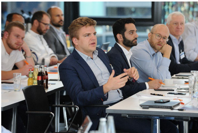
Image 4: Insider event for the hydrogen community: Over 70 participants met at the fourth LKH 2 in fall 2023 to learn about new approaches to laser-based hydrogen production. The event provides a platform for experts from research and industry to exchange ideas and jointly develop solutions for efficient and sustainable hydrogen production.

PRESS RELEASE July 25, 2024 || Page 5 | 6