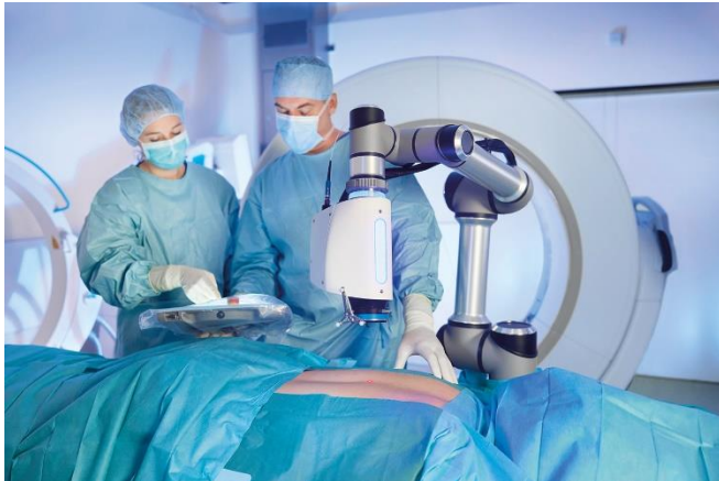
Image 3: High-precision laser operations could also make surgical procedures on the spine near risk structures such as the spinal cord safer and reduce the risk of injury to the patients concerned.