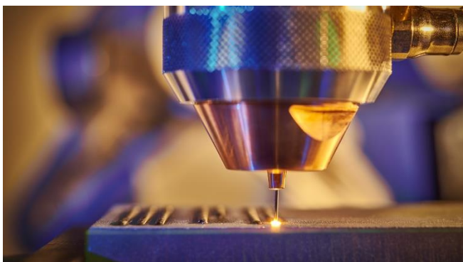
Image 2: From laboratory to application: The Fraunhofer ILT and Cailabs collaboration on wire-based laser material deposition using MPLC beam shaping.