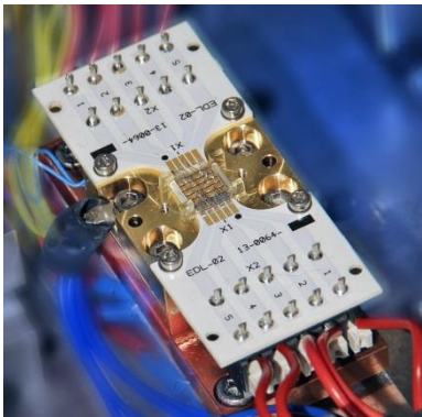
Picture 2: Mounting of individually addressable diode lasers with rear and front facet access for CBC.