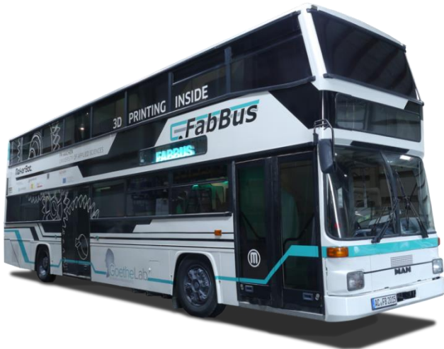
Picture2: With twelve 3D printers and space for up to eight trainees, FH Aachen's FabBus calls at clients' premises.