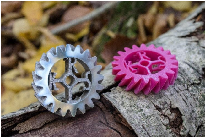
Picture 1: Additive manufacturing of metal or plastic components is the focus of the 3D Valley Conference on September 14 and 15, 2016 in Aachen.