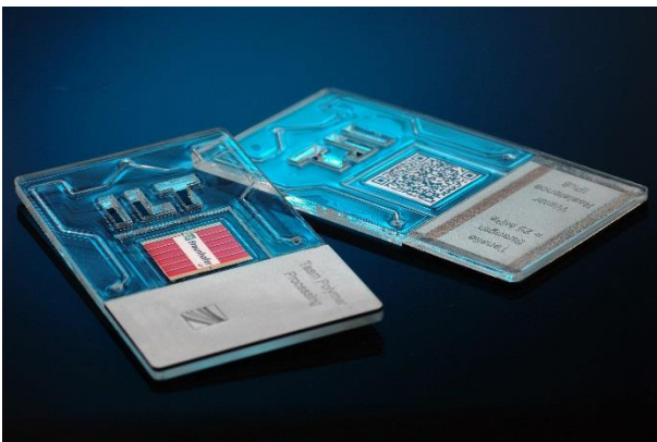
Image 2: Acrylic glass demonstrator fabricated by laser welding, cutting, ablating as well as polymer-metal joining.

The Fraunhofer-Gesellschaft is the leading organization for applied research in Europe. Its research activities are conducted by 67 institutes and research units at locations throughout Germany. The Fraunhofer-Gesellschaft employs a staff of 24,000, who work with an annual research budget totaling more than 2.1 billion euros. Of this sum, more than 1.8 billion euros is generated through contract research. More than 70 percent of the Fraunhofer-Gesellschaft's contract research revenue is derived from contracts with industry and from publicly financed research projects. Branches in the Americas and Asia serve to promote international cooperation.