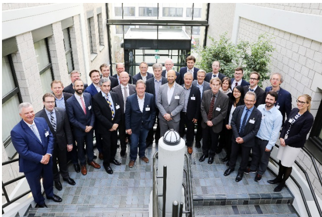
Image 1: Partners from industry and science met on Nov. 14, 2017 for the kick-off of the Fraunhofer futureAM focus project in Aachen.