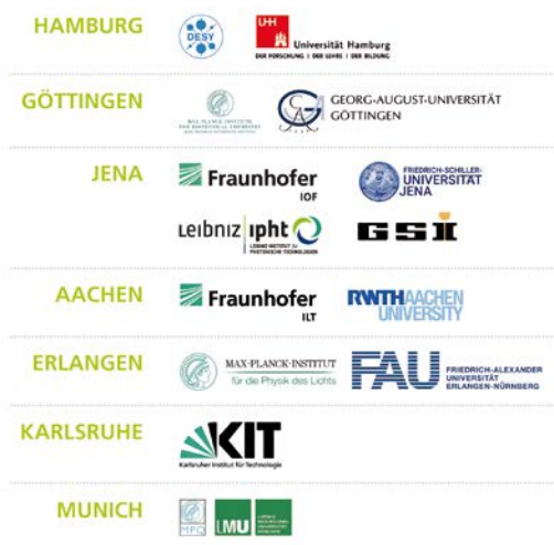
Partners and locations of the Max Planck School of Photonics.

The Fraunhofer-Gesellschaft is the leading organization for applied research in Europe. Its research activities are conducted by 69 institutes and research units at locations throughout Germany. The Fraunhofer-Gesellschaft employs a staff of 24,500, who work with an annual research budget totaling 2.1 billion euros. Of this sum, 1.9 billion euros is generated through contract research. More than 70 percent of the Fraunhofer-Gesellschaft's contract research revenue is derived from contracts with industry and from publicly financed research projects. International collaborations with excellent research partners and innovative companies around the world ensure direct access to regions of the greatest importance to present and future scientific progress and economic development.