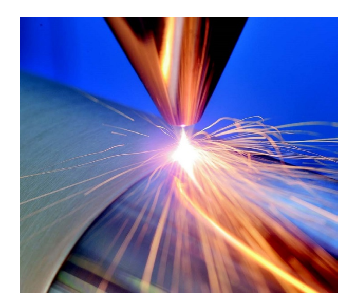
Image 7: Technologies for Additive Manufacturing such as the extreme High-Speed Laser Material Deposition (EHLA) were a hot topic at AKL'18.

PRESS RELEASE May 16, 2018 || Page 9 | 9