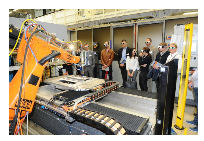
Image 4: Fraunhofer ILT opened its labs for "Laser Technology Live" during AKL'18 with more than 100 live demonstrations at Europe's largest laser application center.