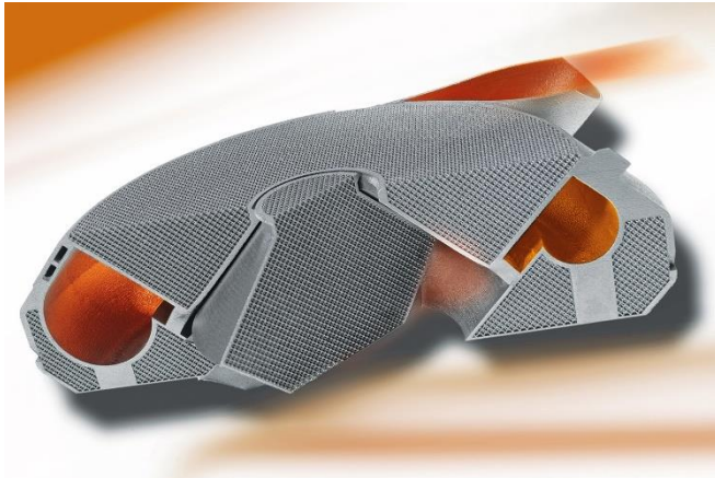
Image 3: At formnext, Fraunhofer experts will show how the industry can successfully leap into a new technology generation of additive manufacturing – by integrating the digital and physical value chain from incoming orders to the finished metallic 3D printed component.